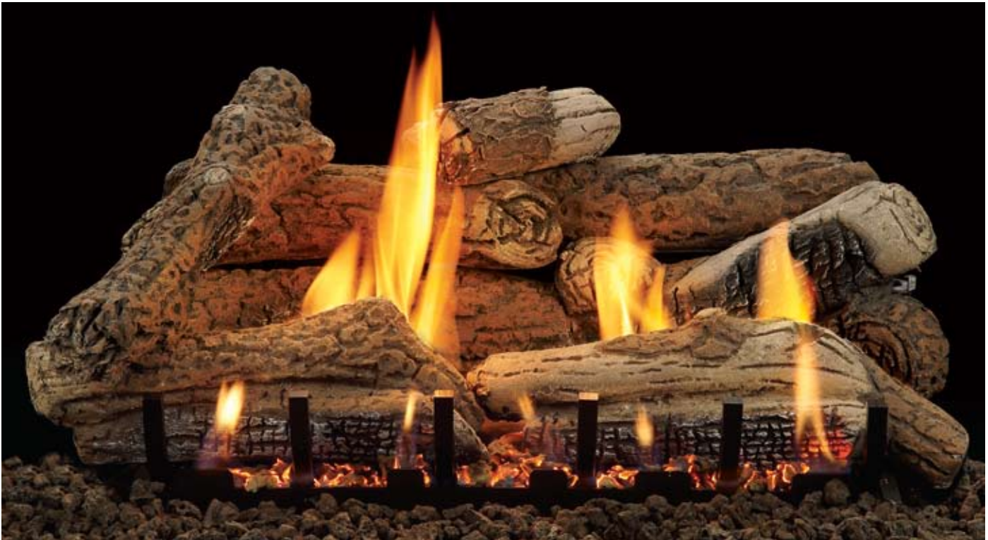
Ceramic Fiber Morgan Creek Log Set (LS-24MC) with Slope Glaze Burner System (VFSR-24)