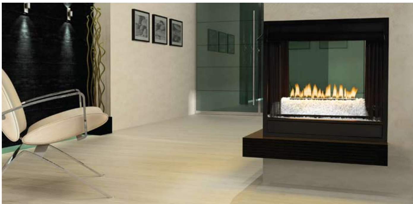
Loft Series Multi-sided burner (VFRU-24) with Clear Frost Decorative Glass (DG-30-CLF). Shown in a Vent-Free peninsula firebox with Flush Louvers.