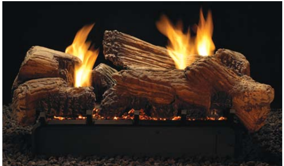
Just like a real wood fire, the Stone River Ceramic Fiber Log Set provides a different look from every angle. The Slope Glaze Vista Burner neatly conceals its controls behind a sliding panel.