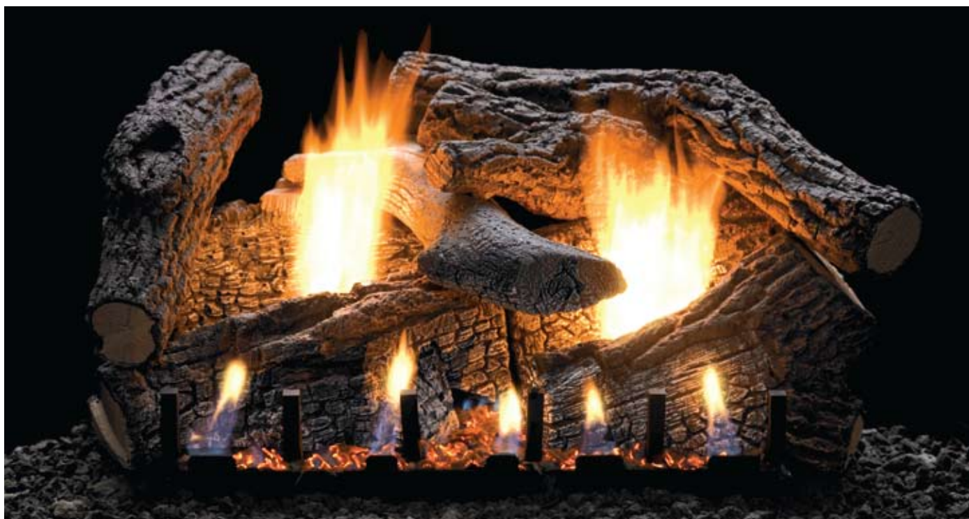
Refractory Super Sassafras Log Set (LS-24RSS) with Slope Glaze Burner System (VFSR-24)