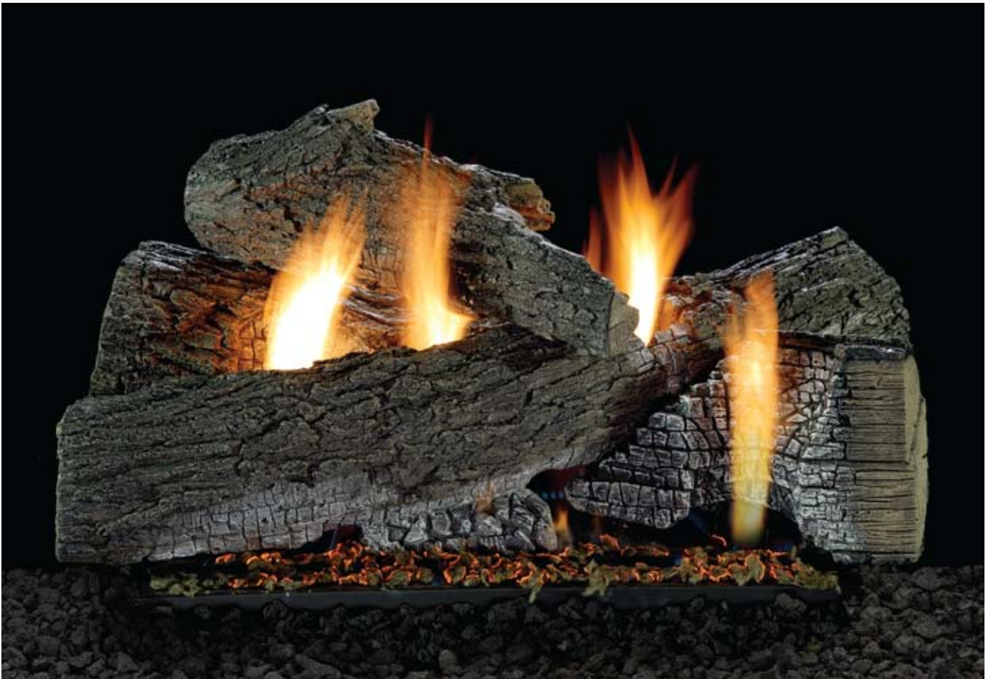
Refractory Wildwood Log Set (LX-24WR) on Harmony Burner with Expanded Ember Bed (VFXI-24)