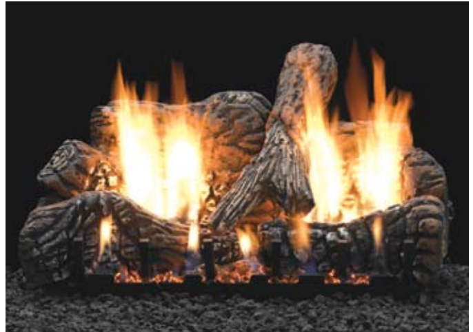
Ceramic Fiber Charred Oak Log Set (LS-24C2) with Slope Glaze Burner System (VFSR-24)

Even our manually controlled log sets offer three heat levels, so you can keep the cold winds at bay without overheating the room.