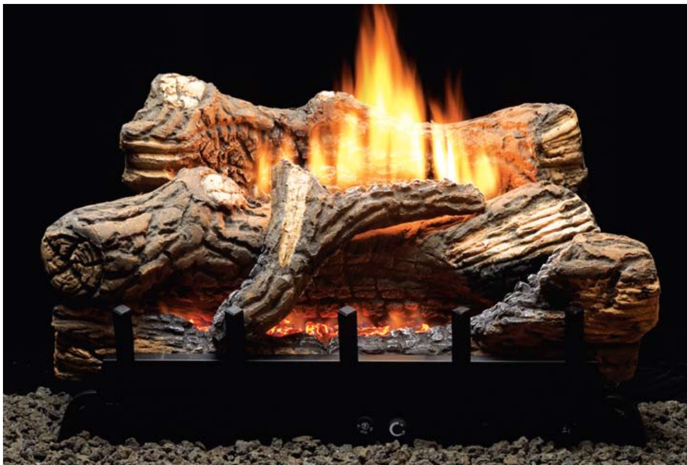
Ceramic Fiber Flint Hill Log Set and Burner Combination (VFDR-24)

This competitively priced log/burner combo requires a minimum firebox depth of just 12 inches, making Flint Hill the ideal log set for existing fireplaces and fireboxes, and for new construction. Available in manual control, thermostat control, or remote-ready Millivolt – in 28,000 Btu, 34,000 Btu and even 40,000 Btu – your Flint Hill Log and Burner Set delivers room-warming performance.