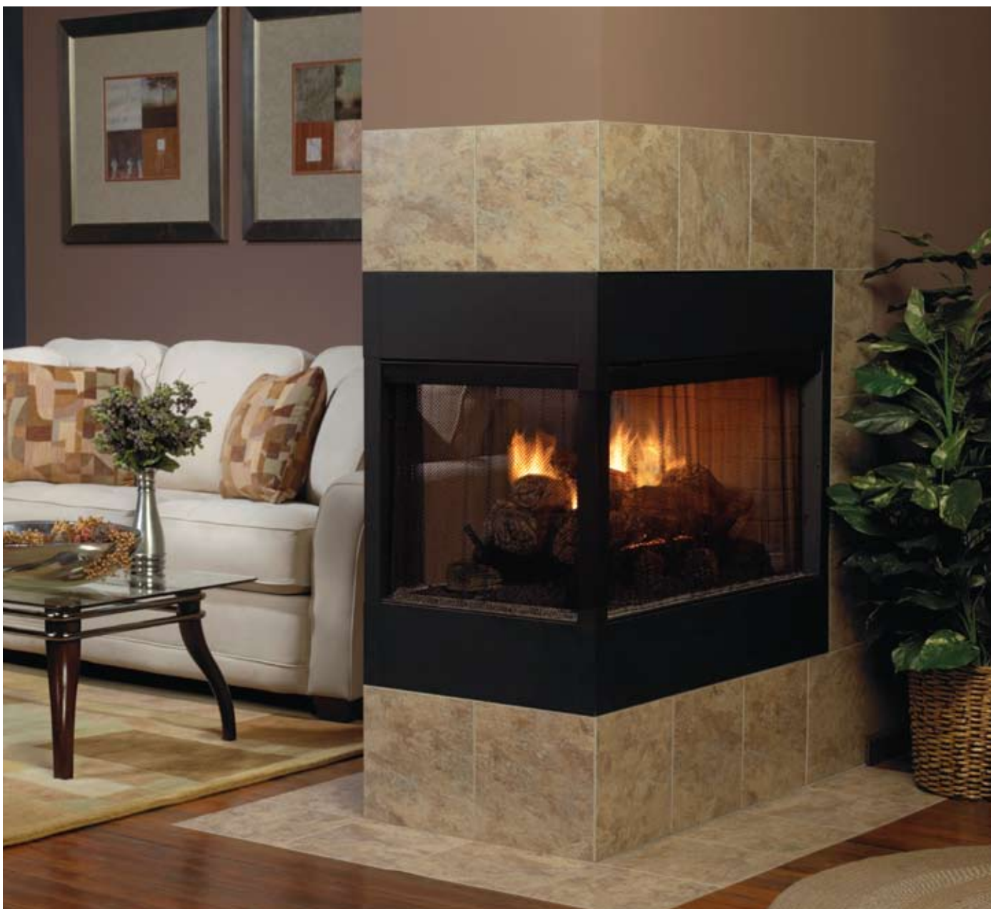
White Mountain Hearth Stone River Log Set (LSU-24SF) on a Vent-Free Slope Glaze Vista Burner. Shown in a peninsula firebox with custom tile surround. The optional Large Log Embers Kit (EK-2) and Platinum Glowing Embers (PE20) add that extra spark of realism.