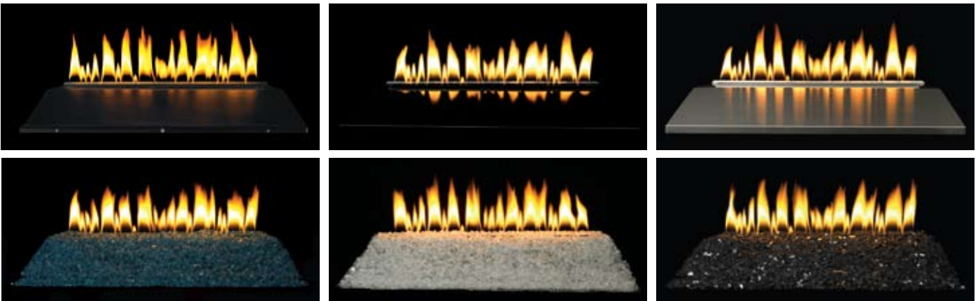
Top Row left to right: No Decorative Options, Polished Black Decorative Top, Brushed Stainless Steel Decorative Top. Bottom Row left to right: Blue Clear Decorative Glass, Clear Frost Decorative Glass, Polished Black Decorative Glass