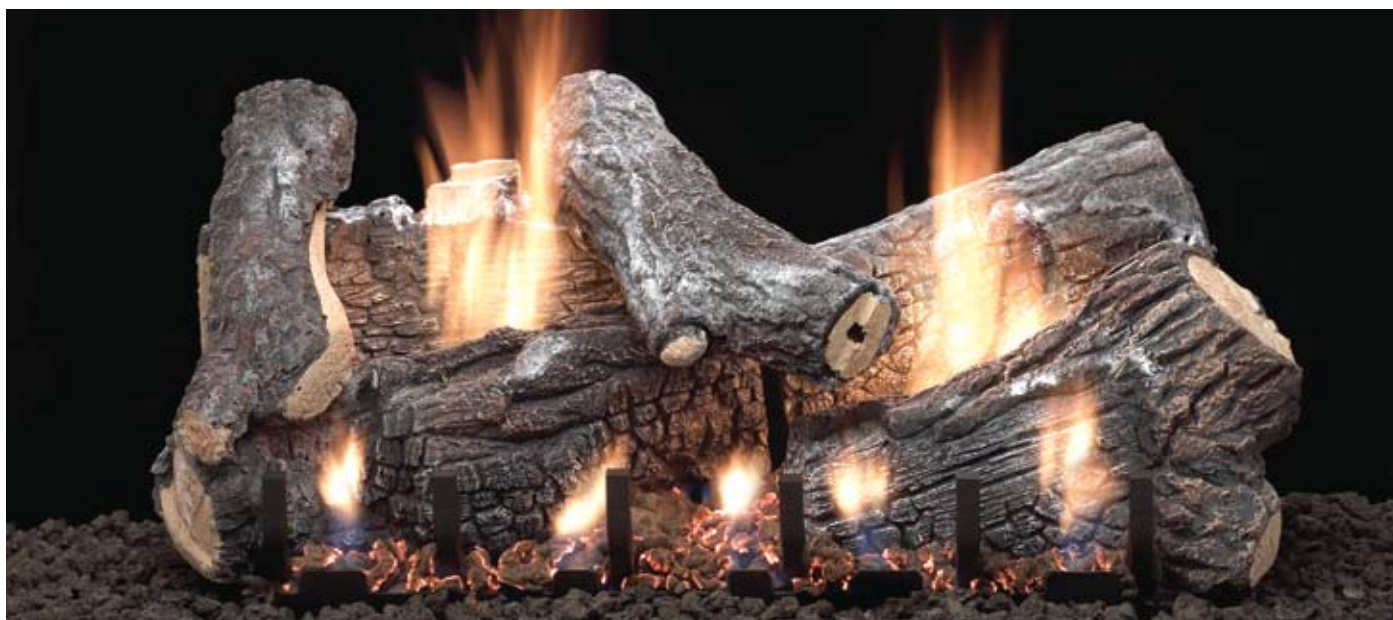
Refractory Sassafras Log Set (LS-24RS) with Slope Glaze Burner System (VFSR-24)