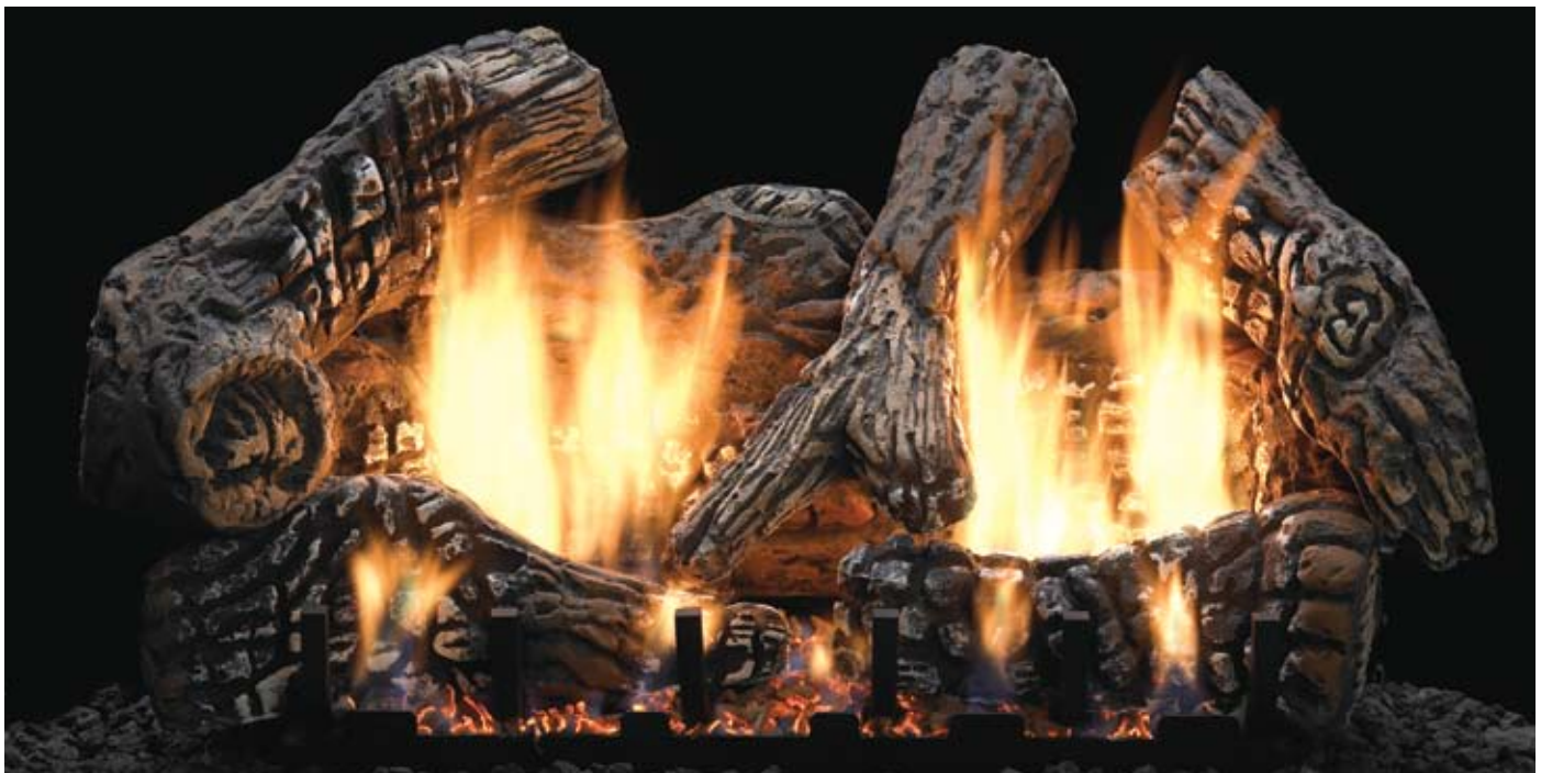
Ceramic Fiber Super Charred Oak Log Set (LS-24C2S Shown) with Slope Glaze Burner System (VFSR-24)