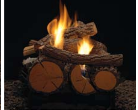
Opposite Side View (above) and End View (below)