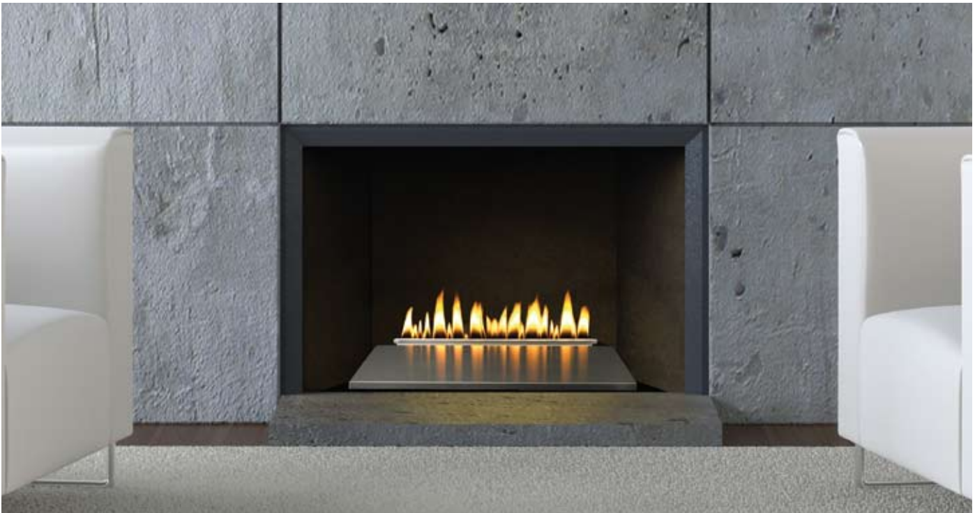
Loft Series Burner (VFRL-24) with Stainless Steel Decorative Top (DT-24-SS). Shown in existing masonry firebox.