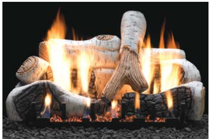
Ceramic Fiber Birch Log Set (LS-24B2) with Slope Glaze Burner System (VFSR-24)