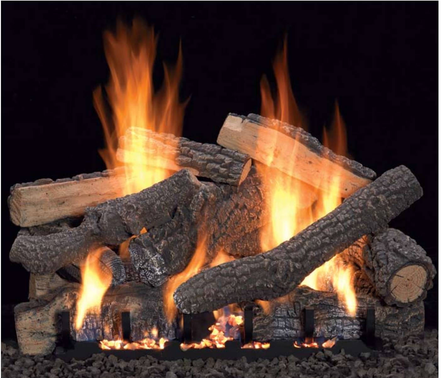
Refractory Ponderosa Log Set (LS-24P) with Vented Slope Glaze Burner System (VSR-24) rated at 75,000 Btu

Our Vented Burners, available in the Slope Glaze Series only, are rated at up to 75,000 Btu to create taller flames. All vented log sets are rated as decorative systems (not for use as heaters), and must be installed in a vented fireplace with the damper open. Vented Slope Glaze burners are available in 18, 24, and 30 inches in Millivolt and manual models. The Millivolt Vented Burners may be operated with an on/off remote control or wall switch. Because they are not heating systems, Vented Burners may not be operated by thermostat.