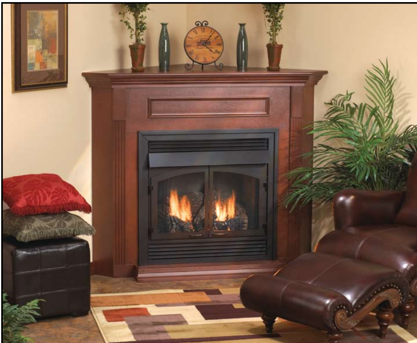
White Mountain Hearth Charred Oak Log Set (LS-24C2) on a Vent-Free Slope Glaze Burner with variable remote control system (VFSV-24). Shown with a 36-inch Breckenridge Deluxe Vent-Free Firebox with Brick Liner (VFD36FB) trimmed in black louvers, black hood, and shown with optional black frame, black door frame and black arch doors (DVF-36BL, VFY-36-SBL, and VFR-36-SCBL). The Cherry Finish on the Standard 36-inch Corner Cabinet Mantel (EMC-36-C) adds drama and warmth to any setting.

Empire manufactures log sets and burners to suit any application. With sizes ranging from 16 inches to 30 inches, and log pieces ranging from slender to massive, the White Mountain Hearth collection is sure to have the perfect set to fill your fireplace.