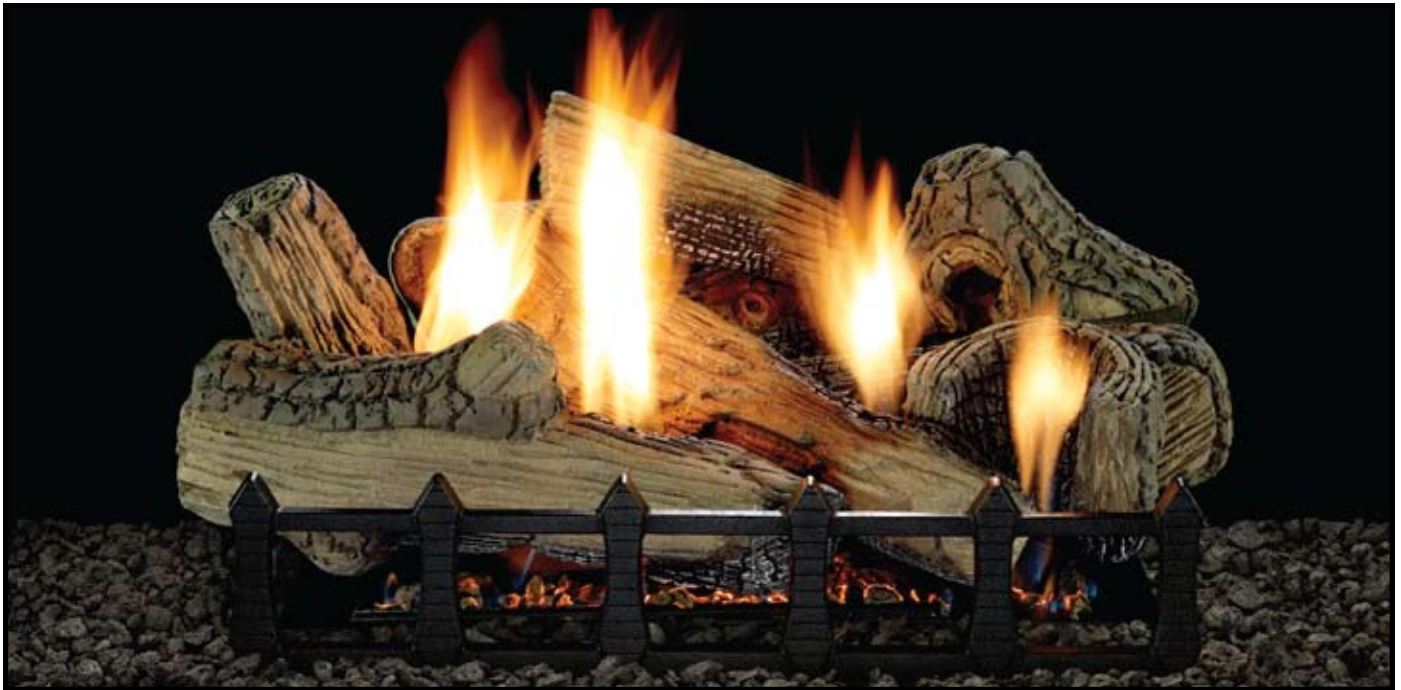
Ceramic Fiber Canyon Log Set (LX-24CF) on Harmony Burner (VFNI-24) with Decorative Cast Grate (DCG-24-BL)