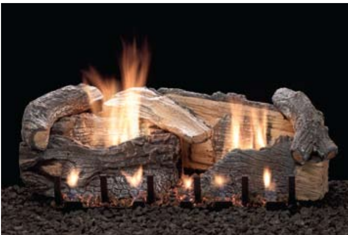
Refractory Aged Oak Log Set (LS-24RAO) with Slope Glaze Burner System (VFSR-24)