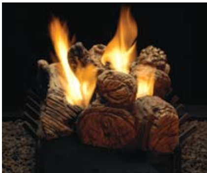
Opposite Side View (above) and End View (below)