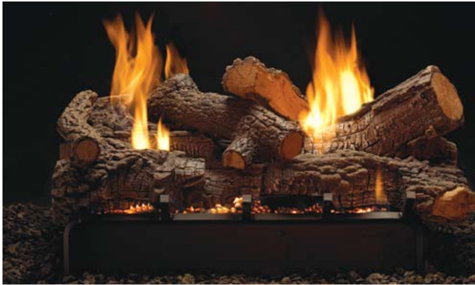
Rugged Refractory logs give the Rock Creek Log Set a rustic look on a grand scale.