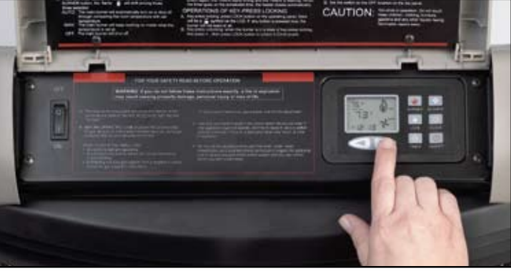
Touch Pad Controls

HR25EL and HR30EN (25,000 LP and 30,000 Btu Nat