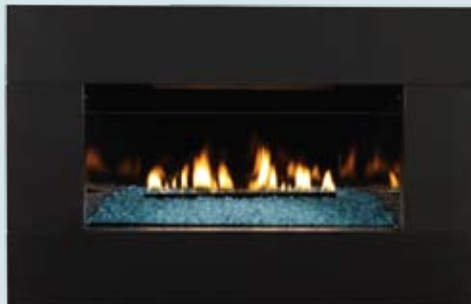
20,000 Btu Loft Series Fireplace with Decorative Metal & Glass Frame and Blue Clear Glass