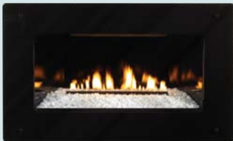
20,000 Btu Loft Series Fireplace with Decorative Glass Front and Clear Frost Glass

Enhance the heat distribution of your Loft Fireplace with the optional blower. The quiet air circulation system features variable speed control and automatic operation.