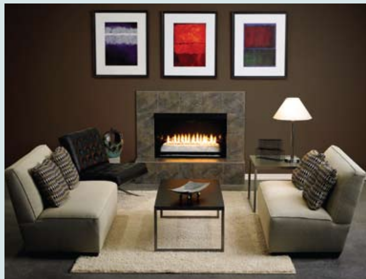
30-inch Loft Series burner with Clear Frost Decorative Glass shown in a 42-inch Breckenridge Deluxe Flush Face Firebox.

The Loft Series Burners are ideal when installed in Empire's Deluxe Vent-Free Fireboxes - available in three sizes (32-inch, 36-inch, and 42-inch) each in traditional louver front or flush front models. To complement the new Loft Series Burner, an optional polished black or stainless steel liner - exclusive to the Deluxe Firebox - creates the perfect setting.