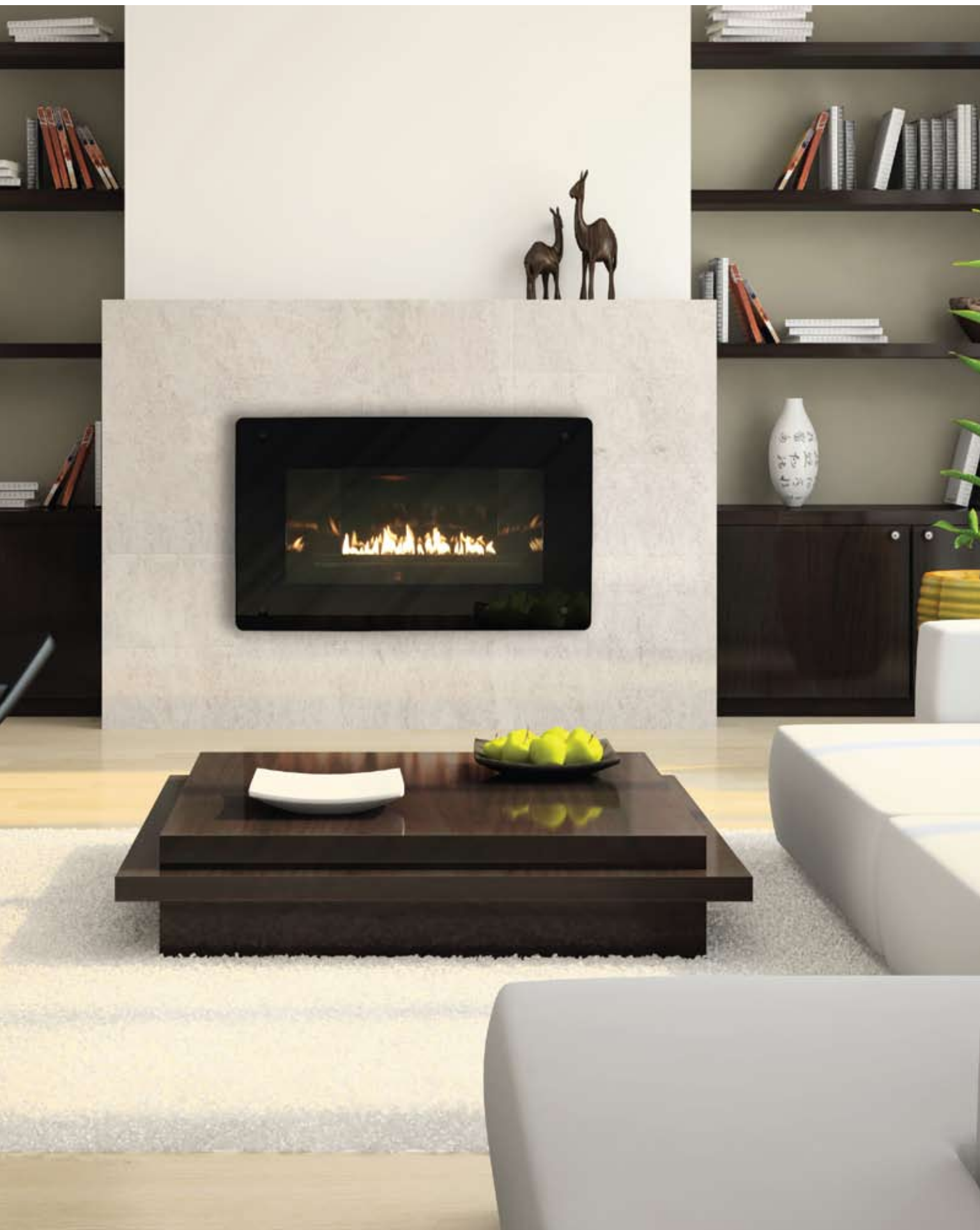
20,000 Btu Loft Series Fireplace with Decorative Glass Front