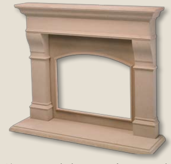
The Montecito is ordered in components featuring separate leg set, mantle, face plate and hearth extension.