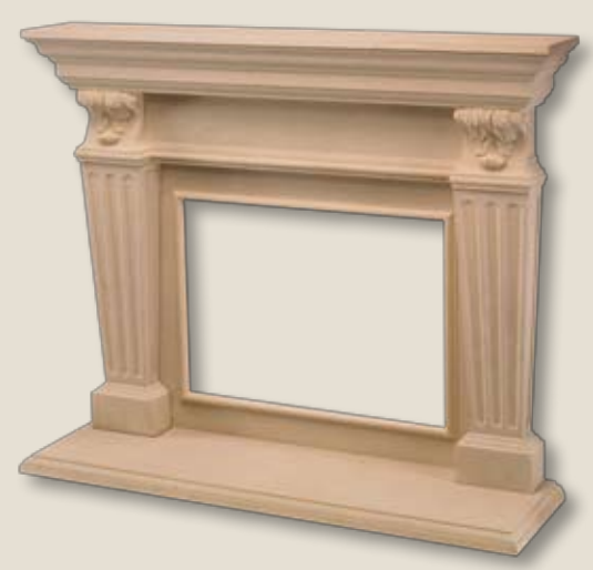
The Marin is ordered in components featuring separate leg set, mantle, undermantle, face plate and hearth extension.

The Marin is available in 3 sizes and 2 custom stone finishes which are integral to the stone material and factory sealed. The reinforced concrete construction is exceptionally durable with unsurpassed detail and quality. It is custom designed for easy installation on a variety of Fmi™, Vanguard® and Design Dynamics™ brand indoor and outdoor, gas and woodburning fireplaces*. It features our patent-pending, fool proof installation system which self-centers the mantle and virtually eliminates field cutting, filling and touch up.