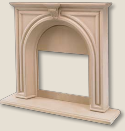
The Cambria is a solid, single piece mantle and surround with face plate and hearth extension ordered separately.

The Cambria is available in 4 sizes and 2 custom stone finishes which are integral to the stone material and factory sealed. The reinforced concrete construction is exceptionally durable with unsurpassed detail and quality. The Cambria is custom designed for easy installation on a variety of Fmi<sup>™</sup>, Vanguard<sup>®</sup> and Design Dynamics<sup>™</sup> brand indoor and outdoor, gas and woodburning fireplaces<sup>*</sup>. It features our patent-pending, fool proof installation system which self-centers the mantle and virtually eliminates field cutting, filling and touch up.