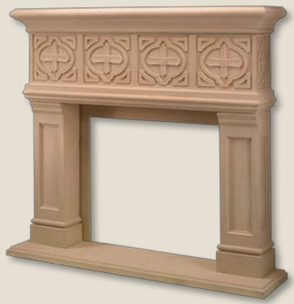
The Monterey is ordered in components featuring separate leg set, mantle, undermantle, face plate and hearth extension.