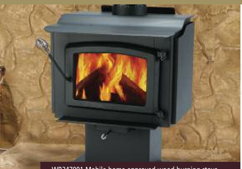
WR247001 Mobile home approved wood burning stove