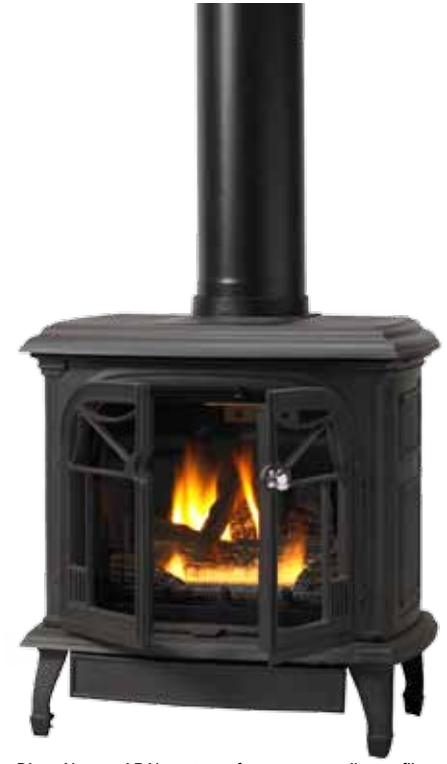
Direct Vent and B-Vent stoves feature a new slim profile.

Note: When the Oxford Cast Iron Stove is placed on carpet a floor pad must be used.