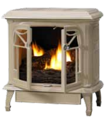
Antique White - CISAW