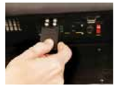
26", 32" & 36" fireplaces feature a convenient storage nook for the remote control.