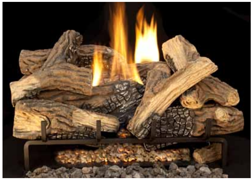
24" Scarlet Oak