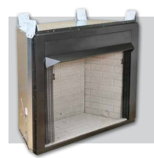
The Full-View Firebox features a tall opening, which more closely resembles a masonry fireplace. This model comes in three sizes: 32", 36" and 42".