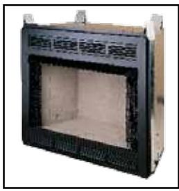
LogMate Firebox, circulating