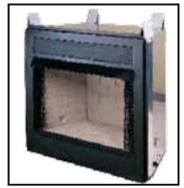
LogMate Firebox, non-circulating