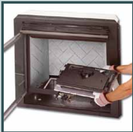
The Value, Performance and Premium burner designs are all sized to fit the mounting recess in the common fireplace chassis.