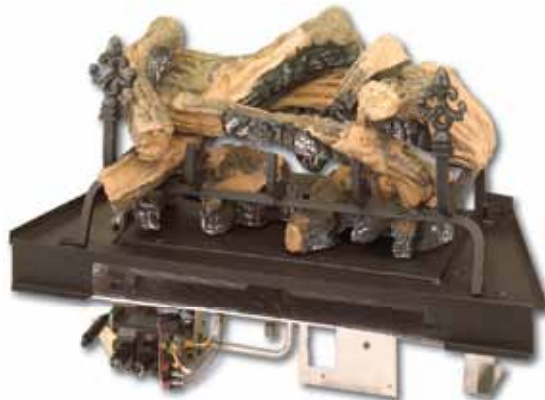
"Performance" models include split oak logs and burnt down remnants with a random look.