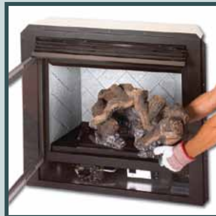
The fully unitized log set is then placed snugly over the burner. The system is just as easily removed and replaced with a new burner and log set.