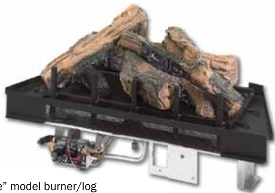
"Value" model burner/log modules feature split oak ceramic fiber logs in a "campfire" style arrangement.