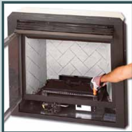
The burner is easily secured to the hearth floor with a series of perimeter screws.